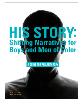
His Story: Shifting Narratives for Boys and Men of Color—A Guide for Philanthropy